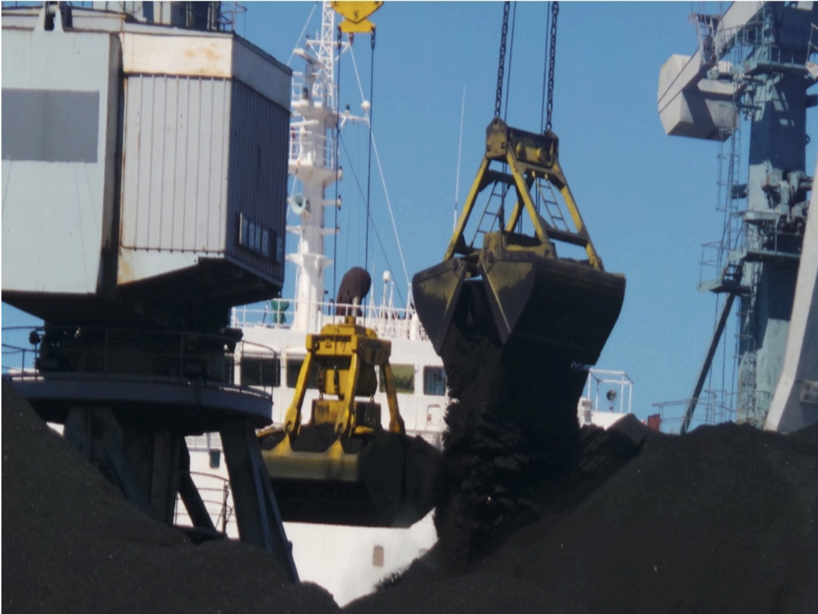
Shown above: Ekers Stividor's ship loading activity at Liepaja.

The loader's direction of movement at the time is presently unknown to us . We understand, however, that the loader's operator has indicated that he simply did not see the worker in the moments leading up to the accident.