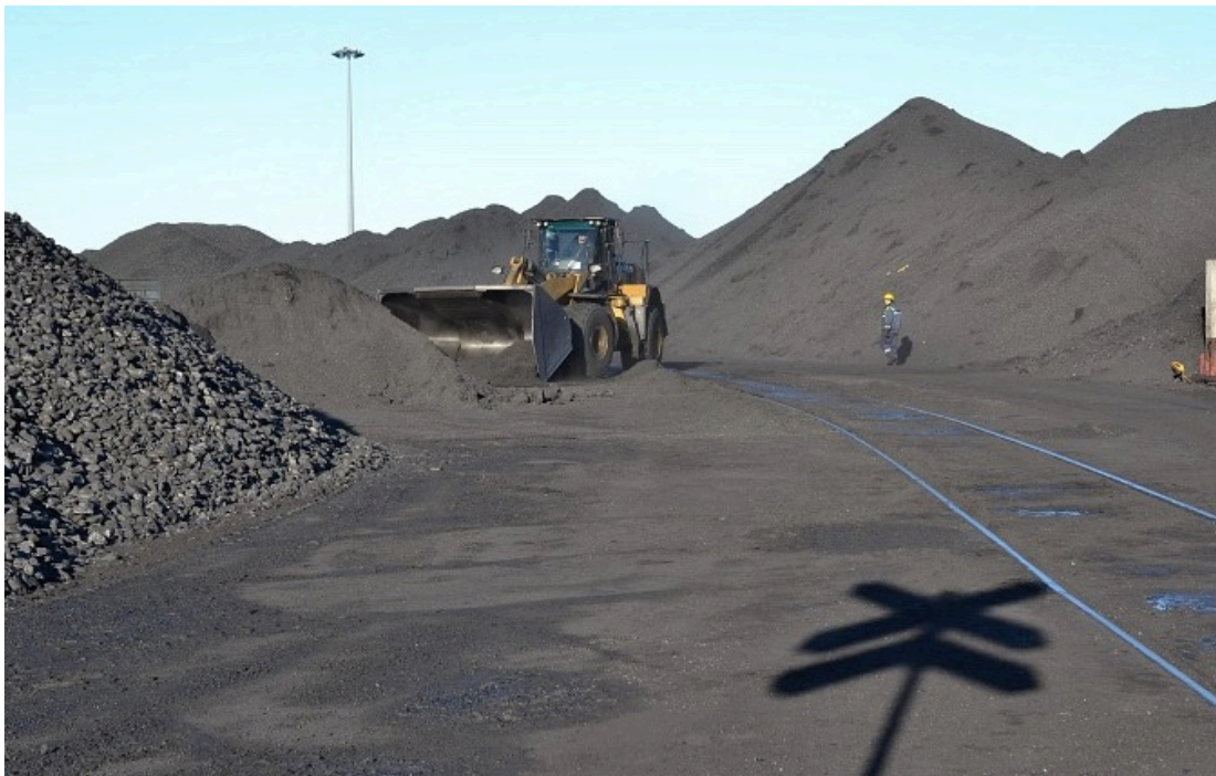
Shown above: Coal being moved by a front end loader at the Liepāja marine terminal.

From European sources, Blueoceana Company is made to understand that a young marine terminal worker lost his life last Wednesday (22 November) in the midst of a coal handling operation at the Port of Liepāja, Latvia. The worker's employer has been identified as Ekers Stividor, LP .