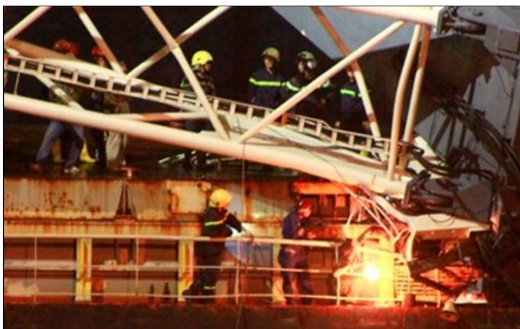
A rescue team dismantles a crane after it suddenly collapsed last night at HCM City's Tan Thuan Port.

HCM CITY (VNS) — A crane with a load capacity of several tonnes suddenly collapsed yesterday at Tan Thuan Port in HCM City's District 7, trapping many workers.